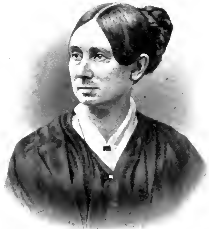
DOROTHEA L. DIX.

Constantinople, Vienna, Moscow and St. Petersburg in search of her wards. Sensitive and trained, she encountered all kinds of men, penetrated into the most loathsome places, and faced cruel sights that